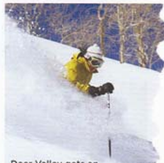
Deer Valley gets an average of 300 inches of snowfall a year

Ever since Norwegian Olympic gold medalist Stein Eriksen opened his eponymous lodge in 1982, it has been the top address on the mountain for those seeking a classic alpine-resort experience. There's always a fire blazing in the lobby amid soaring rock walls, a copper chandelier and a large elk