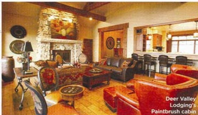
Deer Valley Lodging's Paintbrush cabin

One of its distinct advantages has always been how easy the resort is to reach: There are many flights into Salt Lake City, and then it's a 50-minute highway drive, depending on the