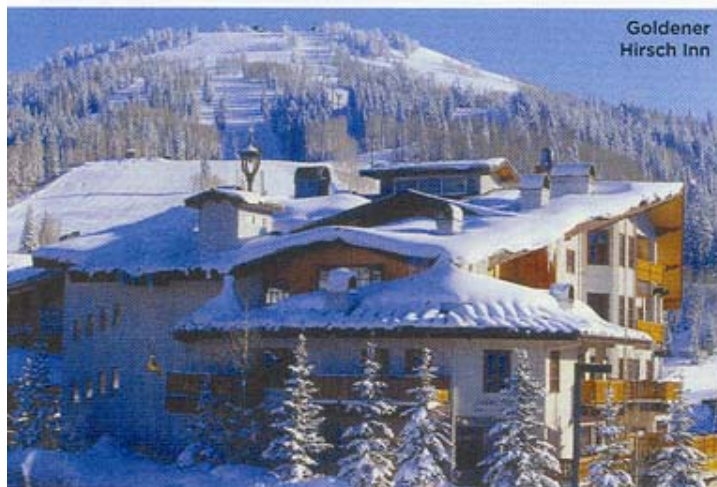
Goldener Hirsch Inn

NO OTHER MOUNTAIN BALANCES SERIOUS SKIING, CREATURE COMFORTS AND FAMILY-FRIENDLINESS SO WELL